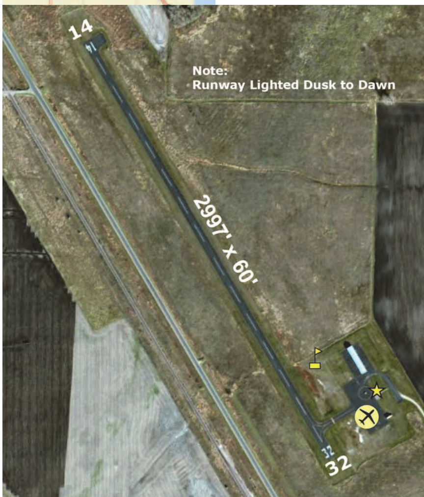
Herman Municipal Airport