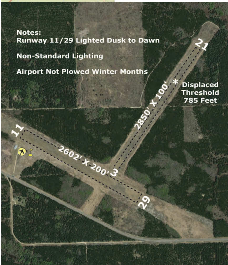
Big Falls Municipal Airport